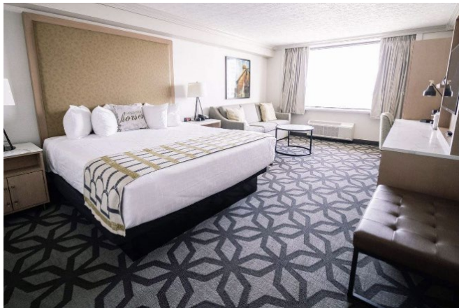
Deluxe Room (on left)