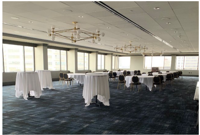
Waterford Room Interior (on right)