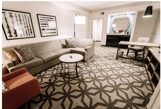
Executive Suite (on right)